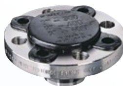
300 lbs. series