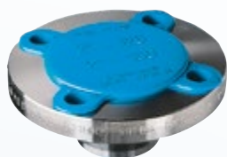
150 lbs. series